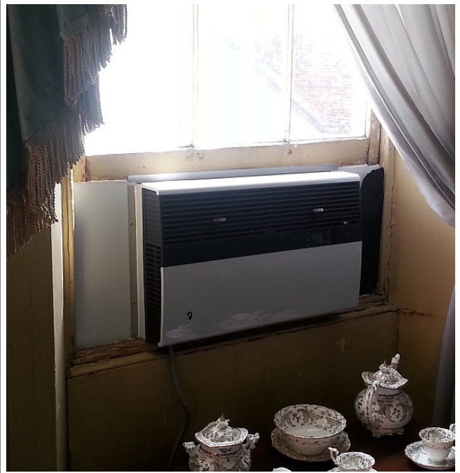
Figure 3B: Window Unit air conditioners are a typical flanking path for outside sounds. This air conditioner and others encountered in the field were the equivalent of leaving the window open. Running the unit creates sound to mask the outside sounds, but also creates a higher inside sound level. Open chimneys are significant sound flanking paths as well. Picture: Hermann Grima House on St. Louis.

The use of “plainly audible” in regard to residences must consider the condition of the building envelope; for example, inside the Hermann Grima house on the second floor, a conversation by passing pedestrians is clearly audible, so external sounds easily penetrate the windows due to air gaps. HUD provides a maximum external Day Night Level (DNL) of 65dB before requiring special consideration for a more robust (soundproof) building envelope (this translates to 55dB at night, however, we are measuring in the vicinity of 65dB (crowd + entertainment noise) at night within the first ½ block of Bourbon. This means that that the bordering residential area requires special approvals if it were to go through HUD for funding. Should there be a “buffer zone” with incentives for sound proofing?