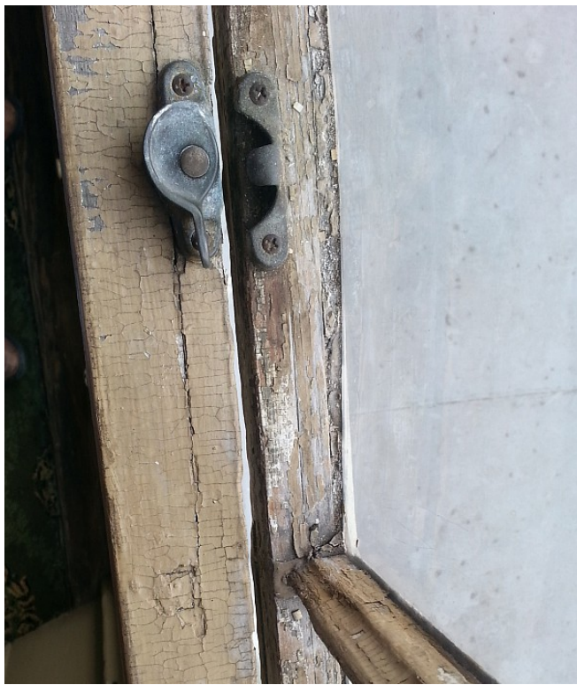
Figure 3A: Cracks or gaps in windows (and doors) are the source of significant sound leakage. Even a well sealed window is considered the weak point of any typical building envelope construction. A fundamental solution is to weatherize the windows and doors, however issues with the climate and breathing of the building envelope can limit the effectiveness of such measures. Picture: Hermann Grima House on St. Louis.